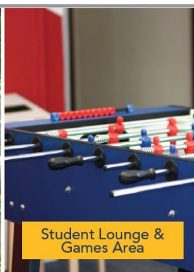
Student Lounge & Games Area