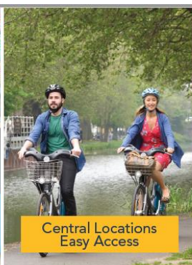
Central Locations Easy Access