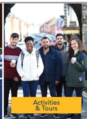
Activities & Tours